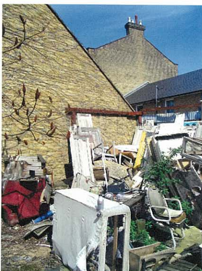
view from 16