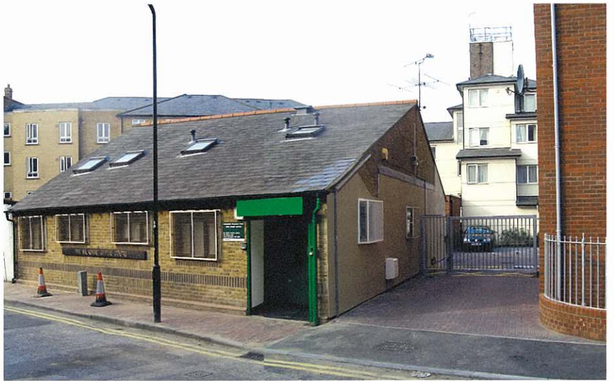
view from 7