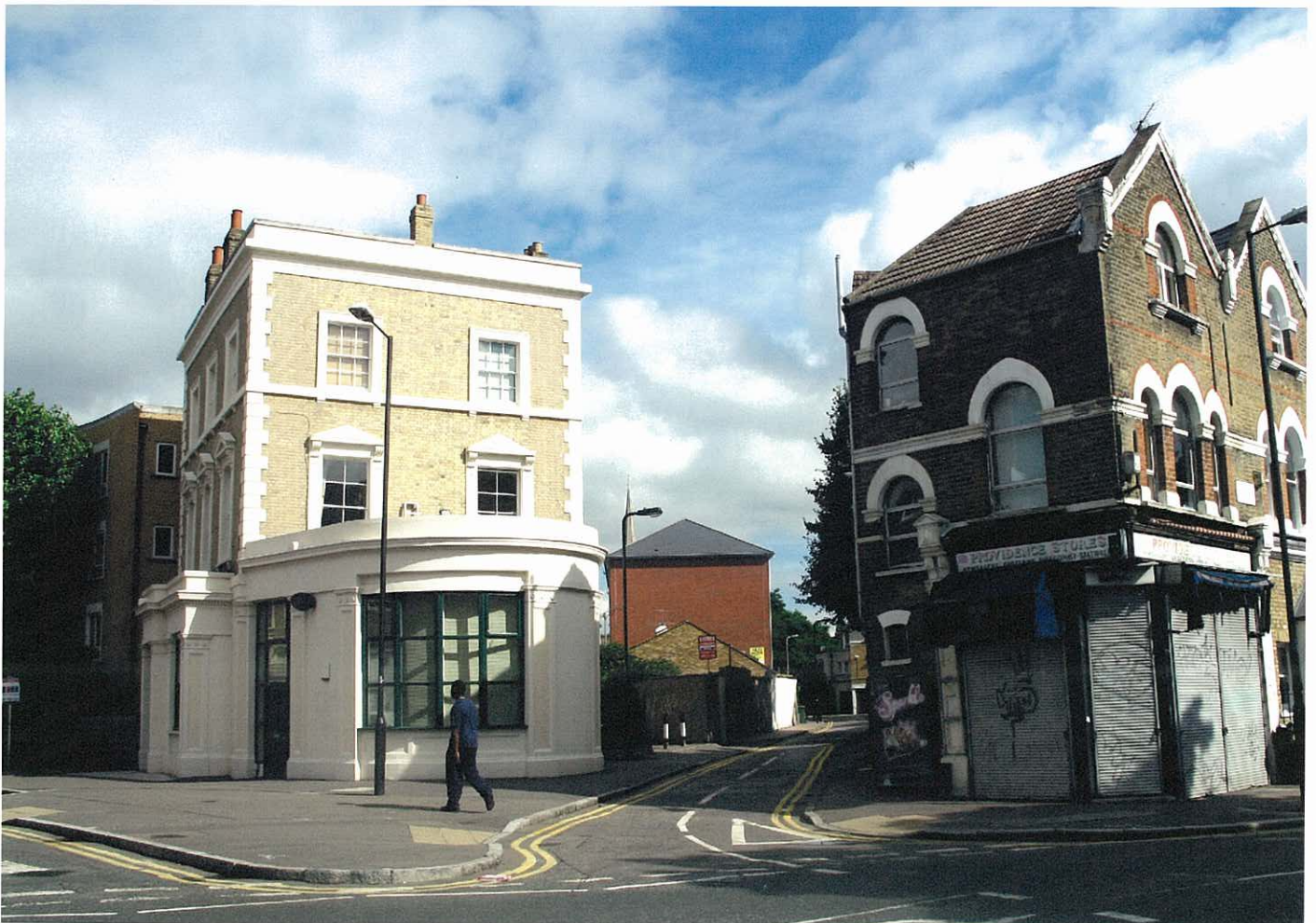
existing view of site from Albion Road