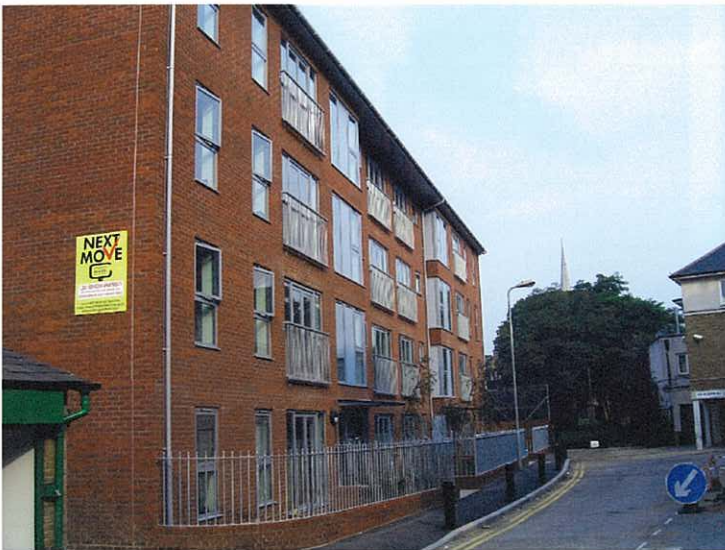
view from 8