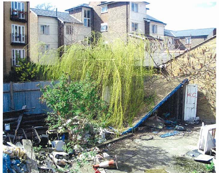
view from 15