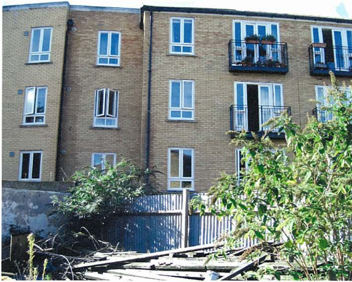
view from 12