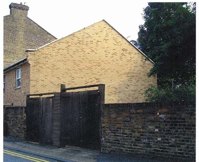
view from 11