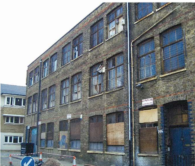
view from 10