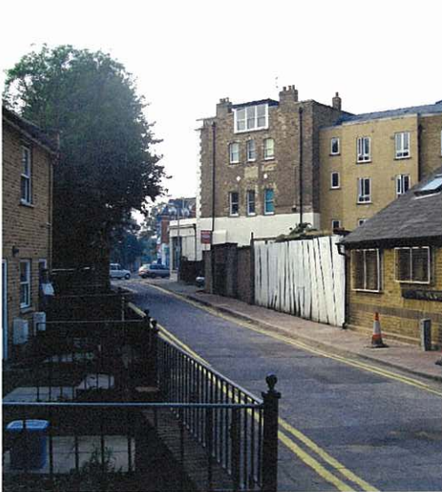
view from 6