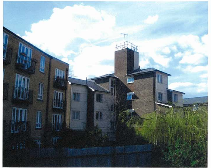
view from 13