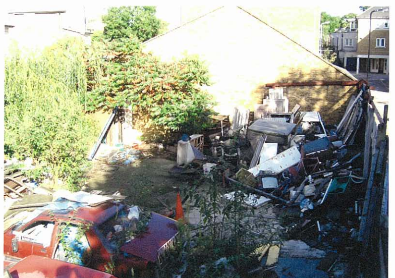
view from 17