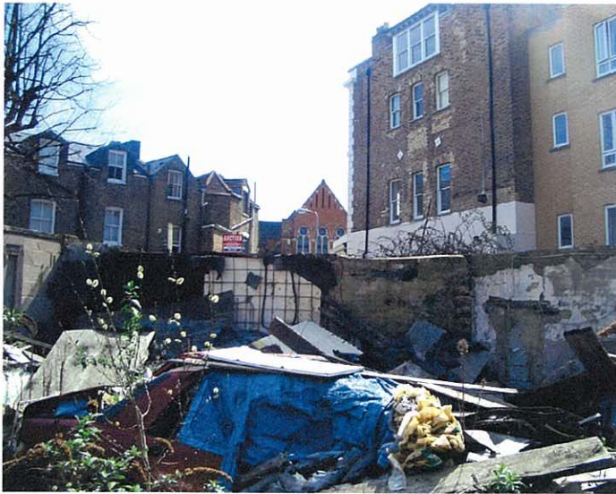
view from 14